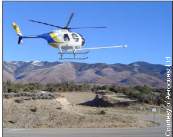
Figure 1: Aeroquest Ltd's helicopter-mounted 'stinger' magnetometer.

Aeromagnetic surveying has several applications, including as a reconnaissance tool before 3D seismic surveys to estimate depths to basement, to inform geological maps and to map mineral deposits. Magnetic fields are measured using magnetometers. In magnetometry, a single sensor is normally used to measure the intensity of the Earth's magnetic field (in units of nano-Tesla; nT). In gradiometry, two sensors mounted either vertically above or horizontally adjacent to each other are used to derive the vertical or horizontal magnetic gradient (in units of nano-Tesla per metre; nT/m). The advantage of gradiometers is that temporal variations in the magnetic field are essentially cancelled out by subtracting the signal from one magnetometer from the signal of the other. Magnetic data may be used not only to map anomalies, but, when processed, can also be used to infer the depth at which the causative bodies lie.