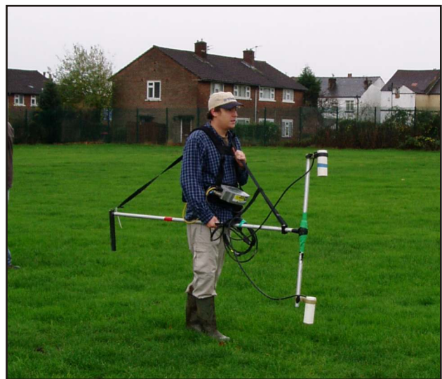
Figure 2: Ground-based magnetic gradiometry survey in progress.

The Earth's magnetic field fluctuates during the day, even in the absence of magnetic storms. A static base station magnetometer is used to record these variations, which can then be subtracted from the total field. There is no need for this processing stage in magnetic gradiometry, since the temporal variations affect both sensors equally, and cancel out. The Earth's 'baseline' magnetic field can be determined for a given site latitude, allowing removal of the International Geomagnetic Reference Field (IGRF) to expose any residual anomalies. Interpretation of the anomaly field allows identification of known features (e.g. pipes, cables) and any remaining anomalous regions in the data set can subsequently be prioritised for further investigation.