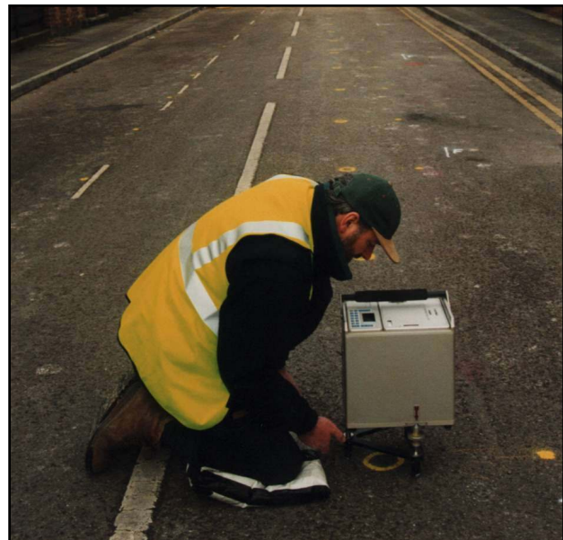
Figure 1: Acquisition of micro-gravity data in a built-up area.

A gravimeter is positioned precisely on a predetermined survey point and values of g are measured repeatedly to produce an average value and standard deviation. A maximum standard deviation may be set before the survey commences, then the instrument will continue sampling until the measured value falls within the given limits. Alternatively, the instrument samples for a set duration and the standard deviation is then calculated for subsequent filtering of the data set. Measurement repeatability is determined by sampling for two periods of 20 seconds duration and comparing the results. With a Scintrex AutoGrav (CG-5) gravimeter up to 100 data stations can be occupied in one day. An