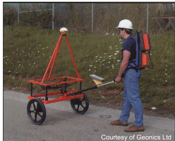
Figure 1: Left: Coil configuration of original EM61 Mk 1 showing orientation of magnetic field relative to target. Right: Geonics EM61 Mk 2 operated in trolley mode. The coincident coils T_x and R_{x1} are located in the lower quadrangle, whilst the upper quadrangle houses R_{x2} . Survey positioning data are acquired using a GPS antenna mounted above the coils.