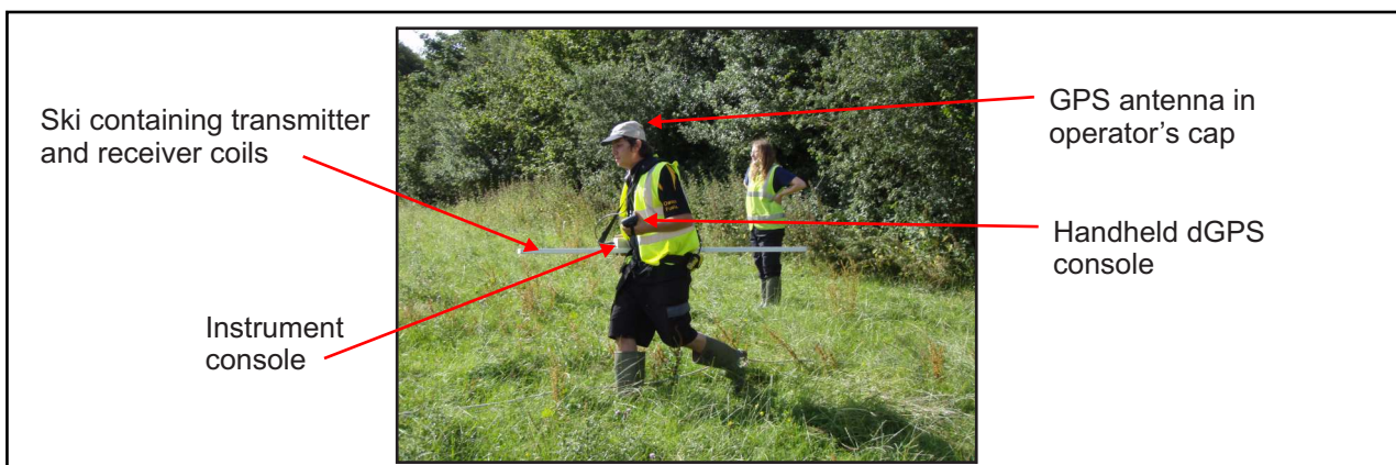
Figure 1: A GEM-2 survey in progress using a vertical dipole/horizontal coil orientation.

The depth penetration of the GEM-2 is dependent on the coil orientation and on the frequency. The GEM-2 can record up to fifteen frequencies simultaneously. The frequency band within which the GEM-2 operates is 330 Hz to 48 kHz. Higher frequencies generally respond to shallower parts of the ground than lower frequencies, so using a range of frequencies means that a greater range of depths is sampled than would be using a single frequency. However, the resistivity of the ground limits the depth to which any EM instrument can 'see'. Geophex estimate the GEM-2 should be able to see about 20-30 m in resistive areas ( >1000 \Omega\text{m} ) and about 10-20 m in conductive areas ( <100 \Omega\text{m} ). The more conductive the ground, the shallower the GEM-2 can see; for very conductive ground conditions the depth at which the lower frequencies sense is greater than the depth to which the EM radiation can penetrate, and the lower frequencies are effectively blinded. The more frequencies that are used, the less power is assigned to each frequency, so in noisy environments (for example urban sites) fewer frequencies are used than on quiet sites (for example rural areas). Generally, three to five frequencies are used on a typical survey, and the range of frequencies is carefully chosen to return the most usable data possible.