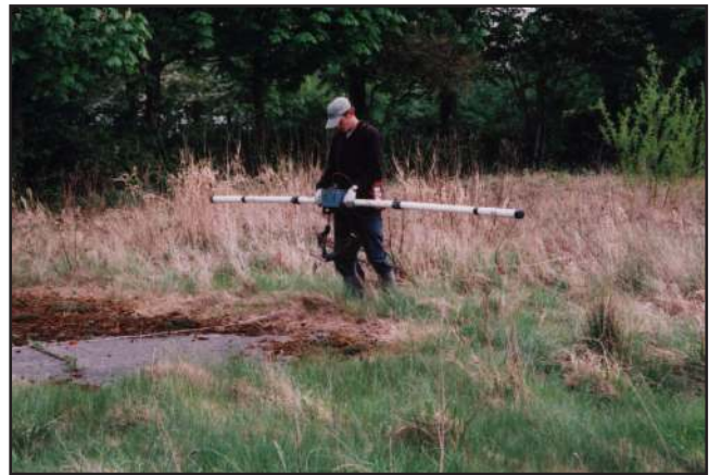
Figure 1: Acquisition of EM31 data on two former industrial sites to map foundations, underground storage tanks, voids, pipes, culverts and possible contamination plumes.