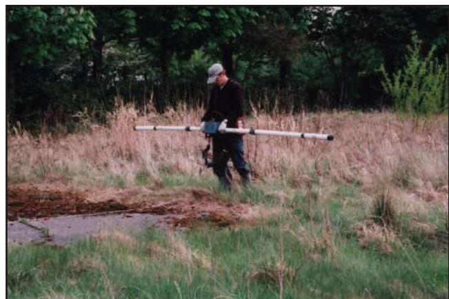
Figure 1: Acquisition of EM31 data.

The true conductivity is a physically diagnostic property and can be used to differentiate between materials. When searching for buried objects and contaminant plumes the interpreter will look for anomalous values in the data. A knowledge of characteristic anomaly shapes is important, as the position of the maximum amplitude anomaly is a function of the width of the causative body and instrument orientation. For example, a narrow conductive body such as a pipe might generate an 'M' shaped anomaly, comprising two high values with a peak-to-peak separation equal to the coil separation. The in-phase component is typically expressed in parts